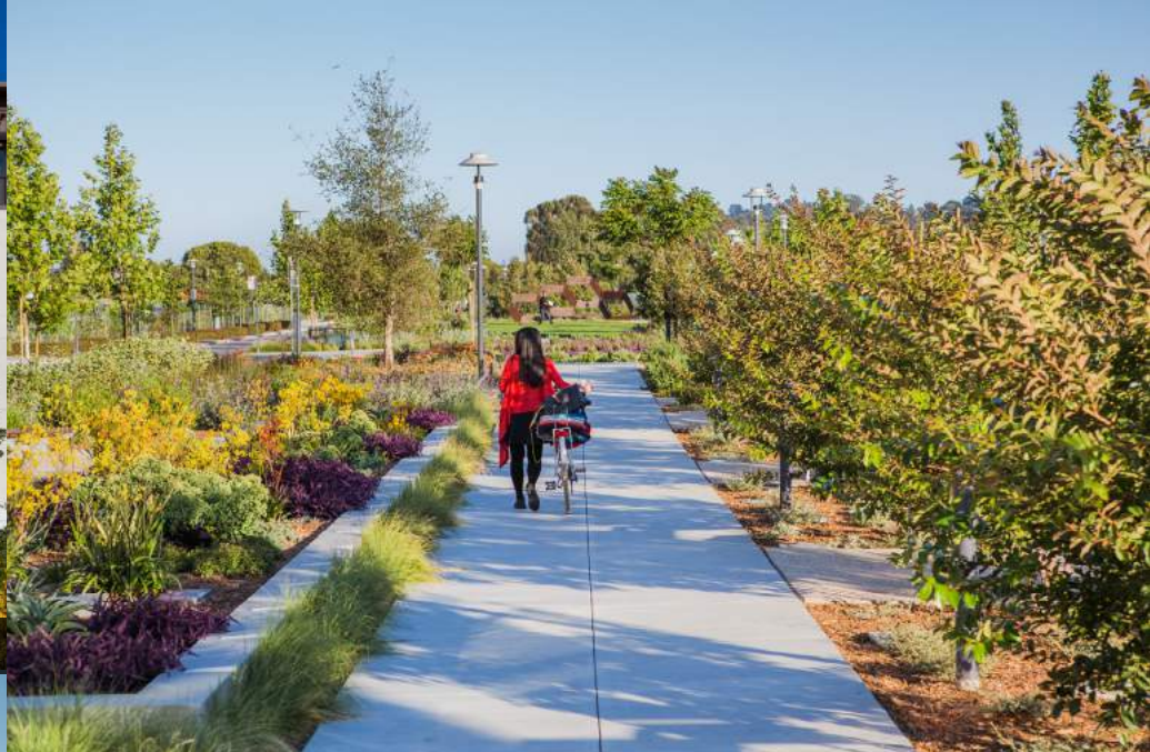
18 ACRES OF PARKS + OPEN SPACE