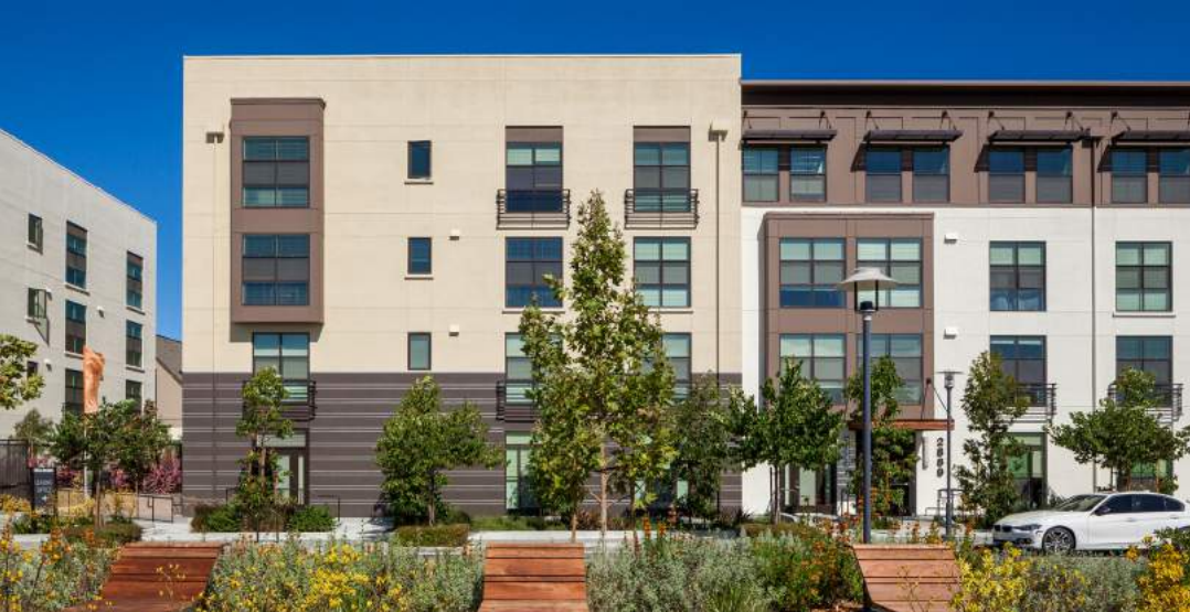
FOR LEASE - APARTMENTS