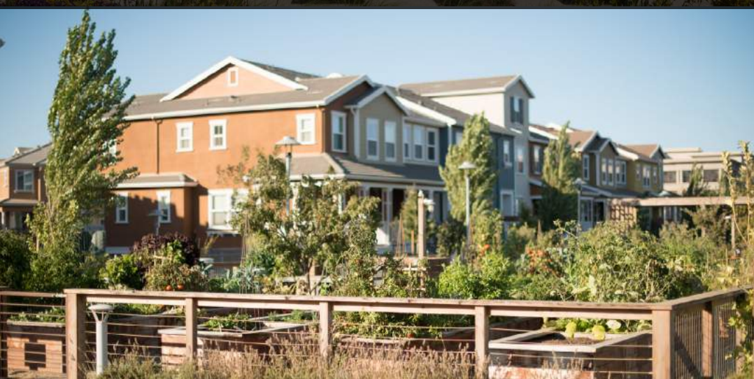
FOR SALE - TOWNHOMES