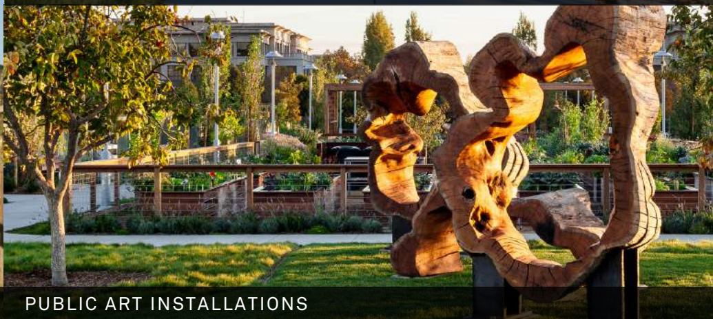
PUBLIC ART INSTALLATIONS